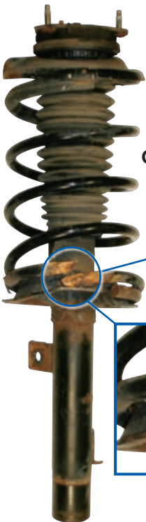
Failed OE coil spring

Stress and corrosion can cause front coil springs to fracture and fail, resulting in suspension noise and sagging.